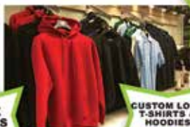
CUSTOM LOGO T-SHIRTS & HOODIES