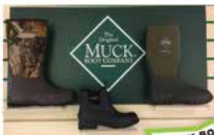
WORK BOOTS & WELLINGTON BOOTS