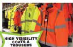
HIGH VISIBILITY COATS & TROUSERS

FREE PAIR OF SOCKS WHEN YOU BUY A PAIR OF DICKIES BOOTS