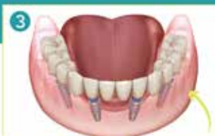
Same Day Implanted Teeth

Derby 01332 896875 Burton on Trent 01283 809679