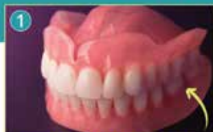
Bespoke High Suction Denture